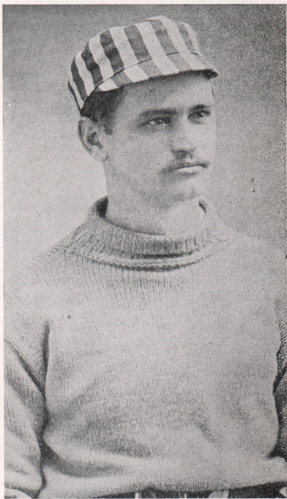
1892—PITCHER Atlanta—Southern League