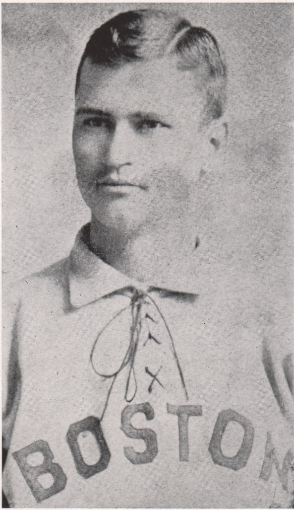
1890—PITCHER Boston—National League