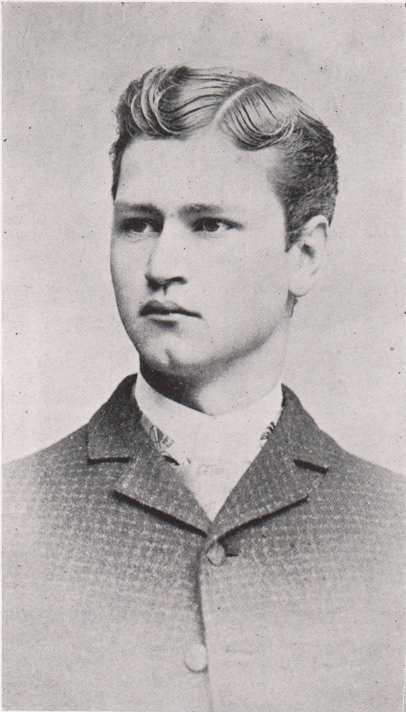
1888—PITCHER Goshen, Indiana Team