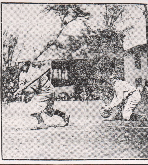
LANDGRAF OF ALLENTOWN AT THE BAT